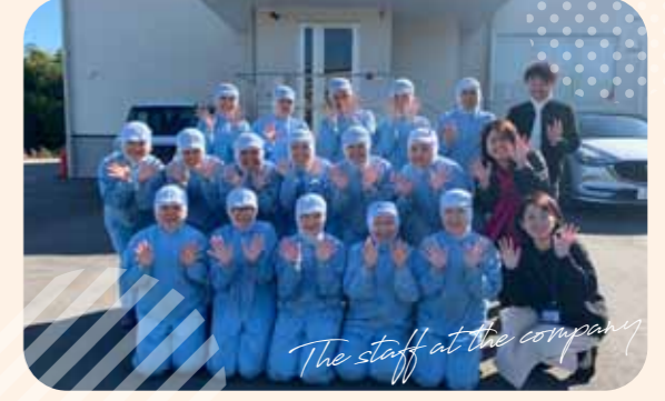
The staff at the company

e-to is a small food company in Miyazaki started by three housewives. Our motto is to develop and sell "new" and "delicious" products using "healthy" ingredients.